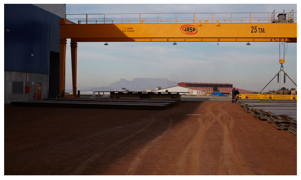
- View of Table Mountain from the GRI site -