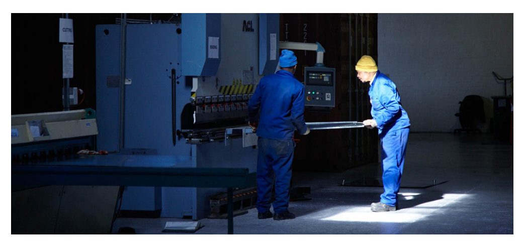
- Inside the South African Renewable Energy Business Incubator in Atlantis -