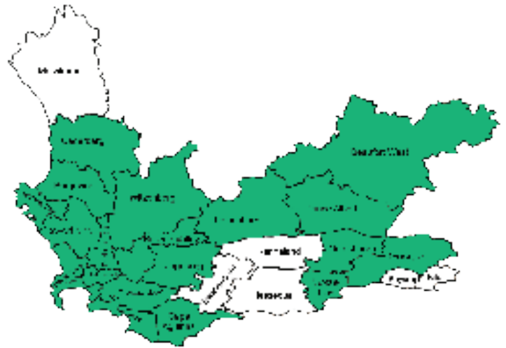
Figure 2: Municipalities that allow small scale embedded generation

Please contact your local municipality electricity department for more info.